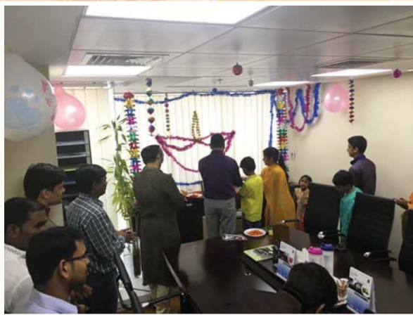
Laxmi Pooja at Kirloskar DMCC