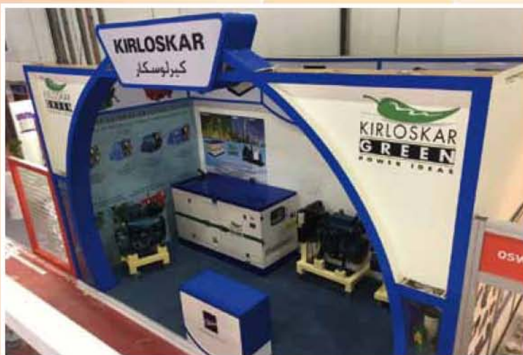
Kirloskar stall at the event.

The 2016 edition attracted 78,869 participants and hosted 2,586 exhibitors from 59 different countries during the four-day show which took place from November 21-24 at the Dubai World Trade Centre (DWTC).