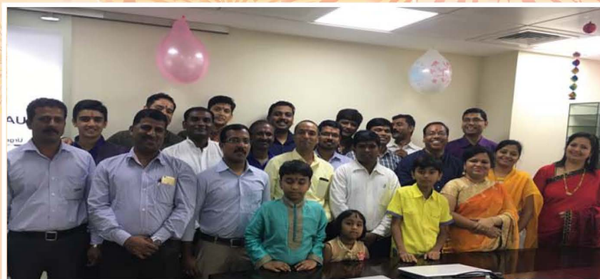
Kirloskar DMCC Family Diwali Celebration