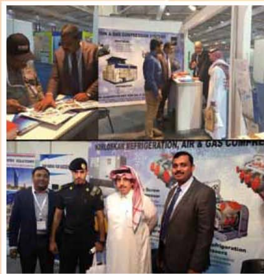
Top: Visitors at KDMCC Stall

Kirloskar DMCC Stand featured the complete portfolio of Air, Gas and Refrigeration packages. With a foot fall of more than 400 customers, Kirloskar Pneumatic Company was the largest Indian company exhibiting their products at this event. SABIC being the fourth largest chemical company in the world and largest listed company in the Middle East, having vendor approval and installation references are considered to be a prestigious organization the industry customers in the Kingdom. Patrons who visited our stand showed considerable interest for Kirloskar Compressors, Pumps, Chillers and Oil Engines.