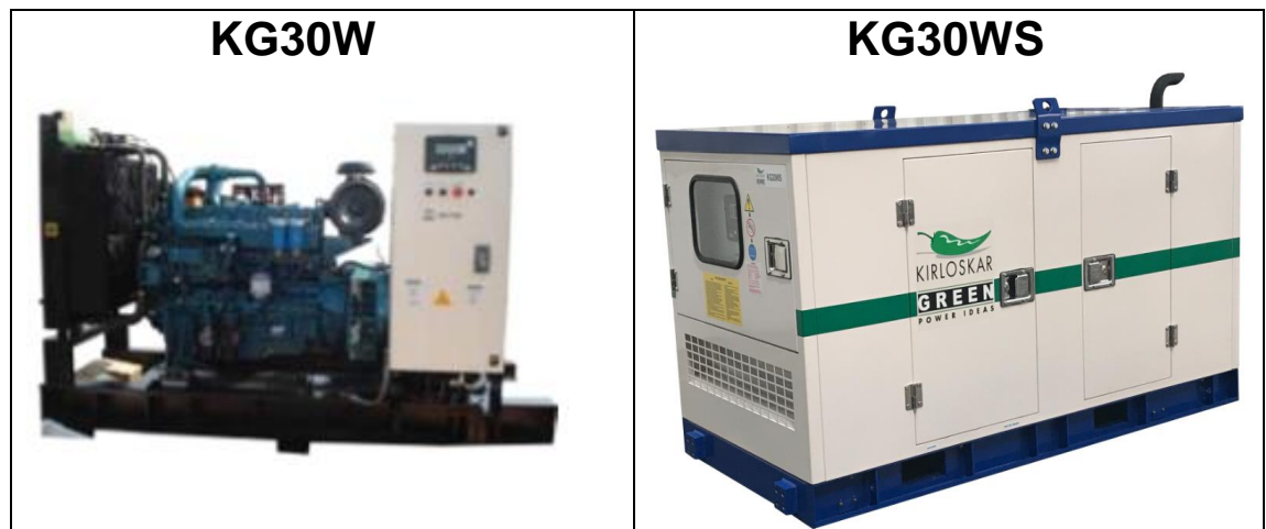
Note: Above picture shown for illustration purpose only, actual product may be different.