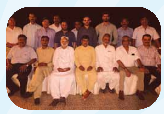
Group photograph with KPCL & PAK delegates

onboard with live Arabic music which left everyone truly mesmerized. Overall, the conference was very well received by all our delegates who despite having a busy schedule, could take out time to make the event a grand success. The support and effort provided by the team at Morgan Energy Solutions towards the conference is also highly commendable.