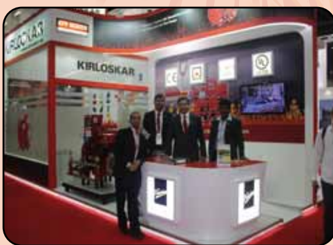
Participation At Intersec, Dubai 2018