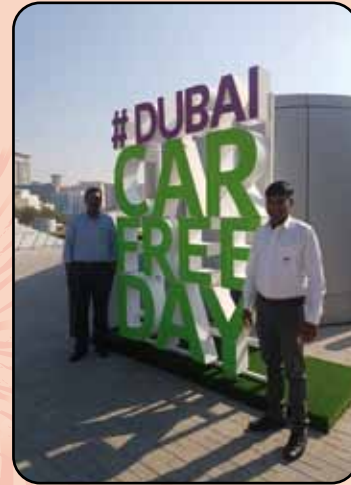
Participation In Dubai Car Free Day