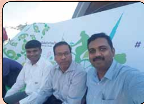
Participation In Dubai Car Free Day